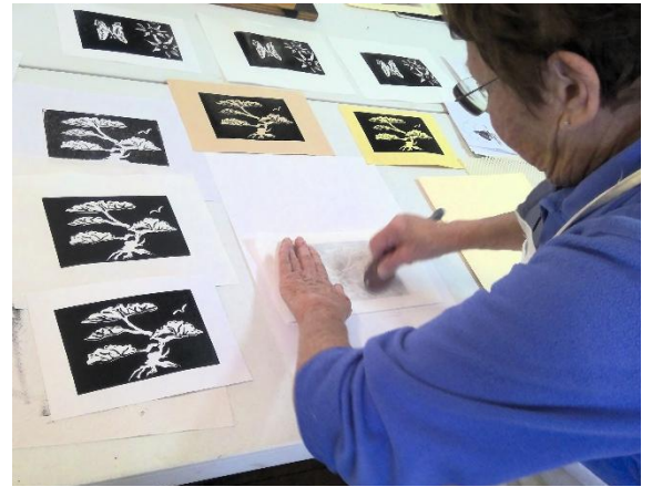
The industry of them all at Kerrie's linocut workshop!