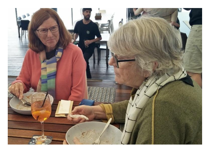
Farewelling Ainslie at The Yamba Tavern

The Art Group meets each Tuesday morning 9- 12 at the Old Tea Rooms at Maclean Showground. Contact is Suz Monin 0434430754.