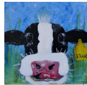
Winner 12-16 years - Chloe - 'Jeffery the Cow'