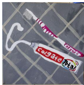
Winner 8-11 years - Kalika - 'Teeth Time'